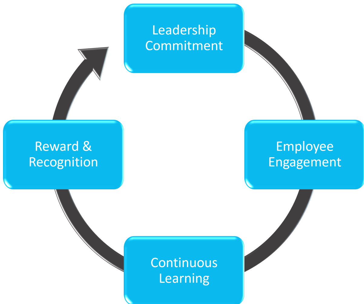
Figure 1: The Pillars of a Culture of Excellence

In addition to these four components, there are many other factors that can contribute to a culture of excellence. These include a clear sense of purpose, strong communication, and a focus on teamwork. By creating an environment where employees feel valued, supported, and challenged, organisations can create a culture of excellence that will help them achieve their goals.